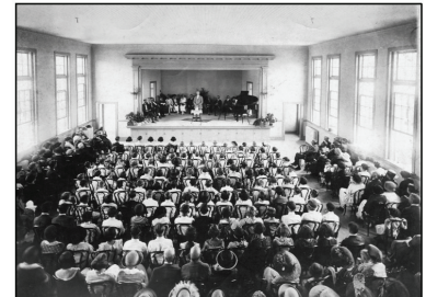
History of Pintlala School Pintlala, Alabama